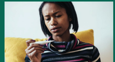
Sore Throat with Fever