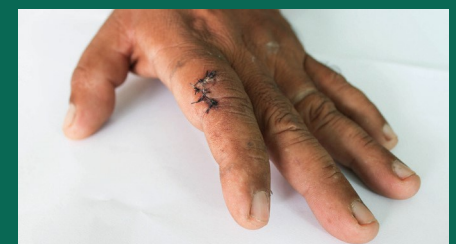
Unprotected & Infected Wounds